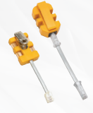
4 and 8 position Modular Adapters